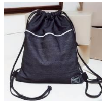
Purse no larger than 8"x 9"